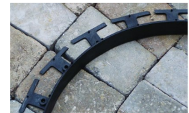
Snip N Flex Feature