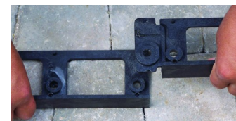
Low Profile Interlocking Joint that Secures with Spike