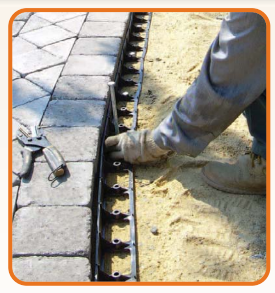
Installs quickly and easily.