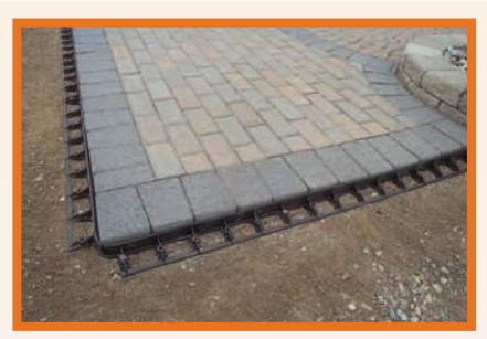
All paver applications require a restrained edge to prevent lateral movement.