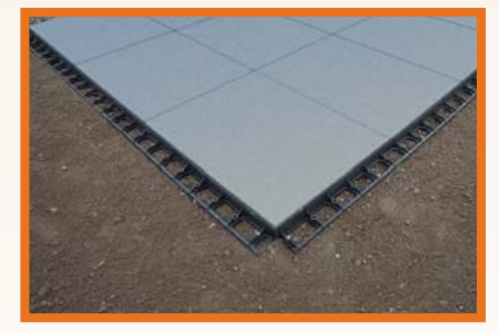
Even patio slabs need the protection of a secure edge restraint.