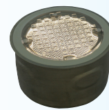
Round 4.2" diameter x 2.6" (d) (107 x 66 mm)