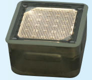
Small Square 3.8" (l) x 3.8" (w) x 2.3" (d) (97.5 x 97.5 x 58.5 mm)