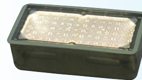
Rectangle 7.8" (l) x 3.8" (w) x 2.3" (d) (197.5 x 97.5 x 58.5 mm)